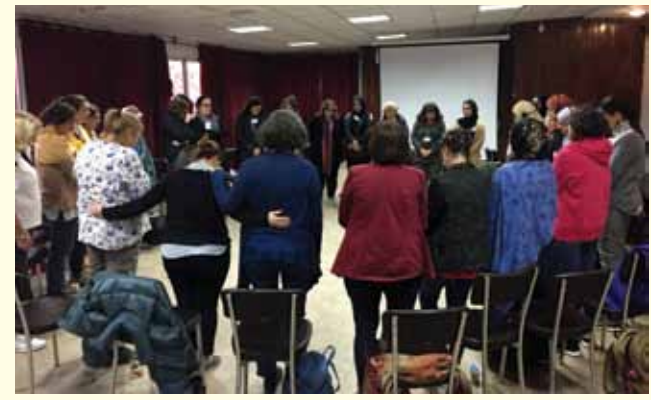
PNE women's group

We held the 14th Annual Israeli-Palestinian Memorial Day Ceremony in partnership with Combatants for Peace. This joint ceremony in Tel-Aviv commemorates the loss of both Israelis and Palestinians. This year once again the Prime Minister of Israel decided to try to prevent the Palestinians from attending, and once again we went to the Israeli High Court and won - and nearly 9,000 people attended. The ceremony was broadcast in many countries, including the U.S.A., England and Germany. It is almost impossible to believe that when we started out with this ceremony over a decade ago, not more than 400 attended. This joint message of the result of the conflict resounds with even the toughest of folk.