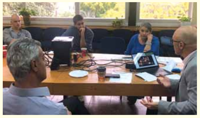
Teaching skills for members to appear on all forms of media, both locally & internationally