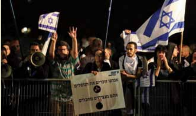
Demonstrators against the Memorial Ceremony