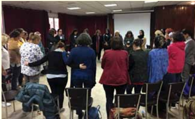
PNE women's group

We held the 14 th Annual Israeli-Palestinian Memorial Day Ceremony in partnership with Combatants for Peace. This joint ceremony in Tel-Aviv commemorates the loss of both Israelis and Palestinians. This year once again the Prime Minister of Israel decided to try to prevent the Palestinians from attending, and once again we went to the Israeli High Court and won - and nearly 9,000 people attended. The ceremony was broadcast in many countries, including the U.S.A., England and Germany. It is almost impossible to believe that when we started out with this ceremony over a decade ago, not more than 400 attended. This joint message of the result of the conflict resounds with even the toughest of folk.