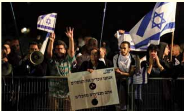
Demonstrators against the Memorial Ceremony